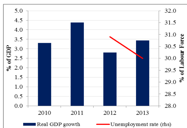
Figure 1: Real GDP and unemployment

The trade deficit was brought down to 31.6% of GDP (2.5 percentage points lower than in 2012) as a result of contracting imports due to weak domestic demand, lower energy prices and somewhat rising goods exports. Concerns that the narrowing of the trade deficit was only temporary rather than of structural nature were reinforced in 2014 as goods exports decreased 0.4% and imports inched up 1.2% thus increasing the trade deficit by 1.4% in the first seven months of the year.