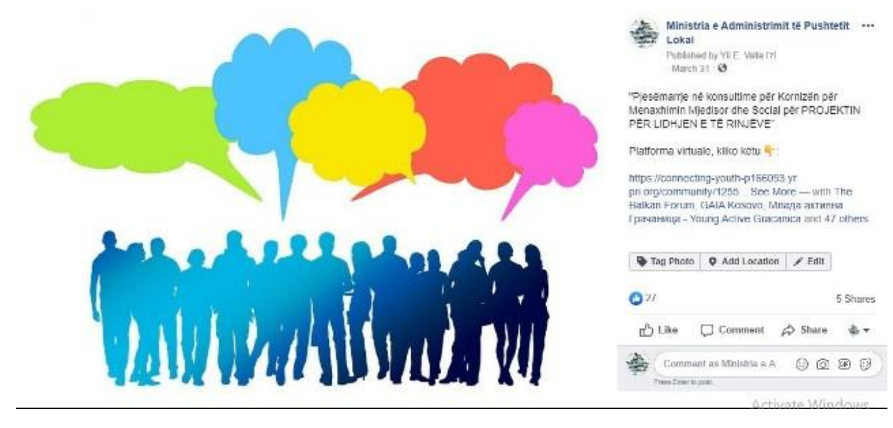
Image 3: Invitation to virtual consultations made via MLGA facebook page

https://www.facebook.com/271521783259793/posts/851064258638873/