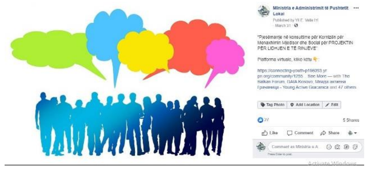
Image 3: Invitation to virtual consultations made via MLGA facebook page